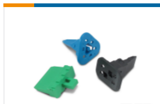
TE Part #W12S Wedgelocks: DEUTSCH DT