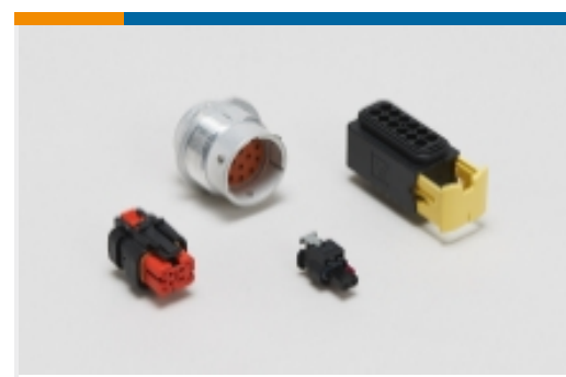
Automotive Housings (619)