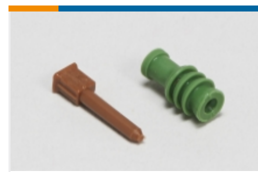
Automotive Seals &amp; Cavity Plugs (6)