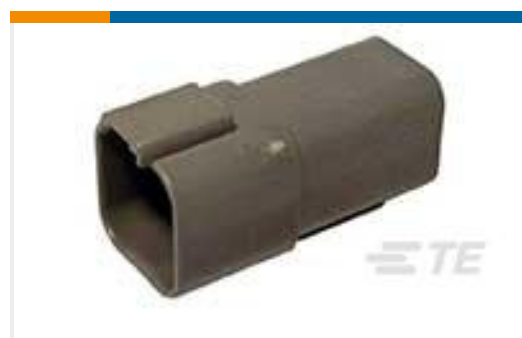
TE Part #DT04-6P REC, 6P, GRY, N