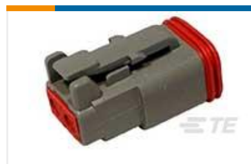
TE Part #DT06-2S PLG, 2P, GRY, N