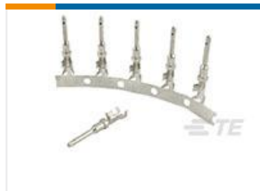
TE Part #1060-16-0122 PIN, SF, SIZE 16, 14-18, NI/SN