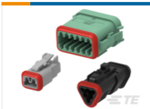
TE Part #DT06-4S DEUTSCH DT Plug Connectors