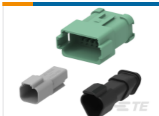
TE Part #DT04-3P DEUTSCH DT Receptacle Connectors