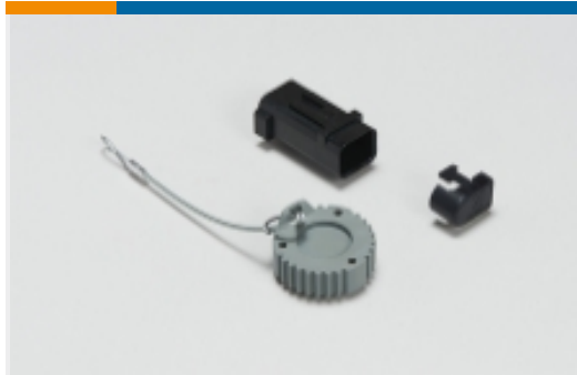
Automotive Connector Caps & Covers (12)