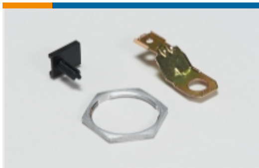
Other Automotive Connector Accessories(5)