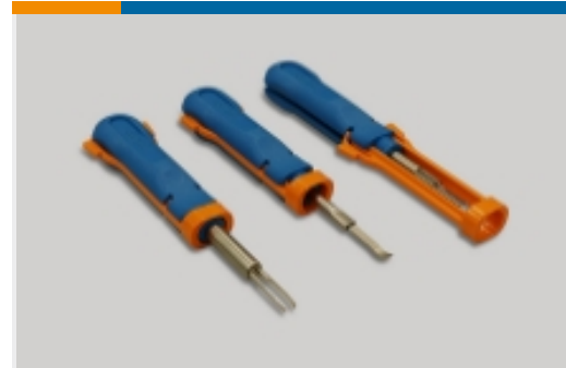
Insertion & Extraction Tools(11)