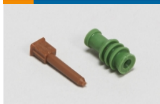
Automotive Seals & Cavity Plugs(1)