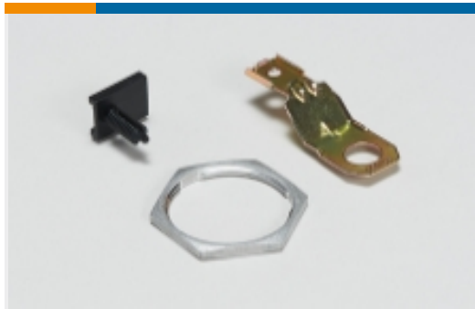
Other Automotive Connector Accessories(11)