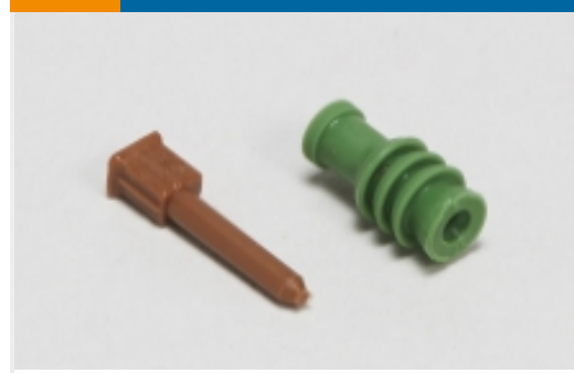
Automotive Seals & Cavity Plugs(10)